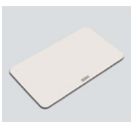
G21.40 white chopping board