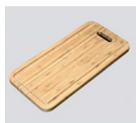
B20.42 chopping board