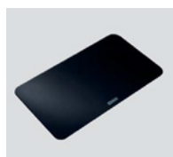
G21.40 black chopping board