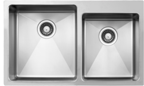
Left hand main bowl pictured