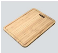
B30.42 chopping board