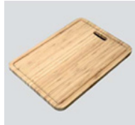
B30.42 chopping board