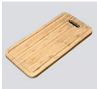
B20.42 chopping board