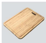
B30.42 chopping board